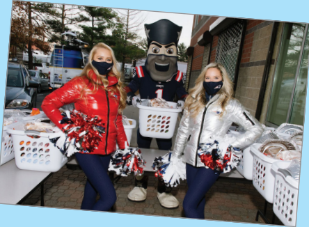
New England Patriots mascot and cheerleaders at Goodwill’s Thanksgiving-in-a-Basket event.

Goodwill created socially distant ways to continue its longstanding holiday traditions. These events are an additional way Goodwill supports program participants who are doing everything they can to enable their families to participate in this special time of year.