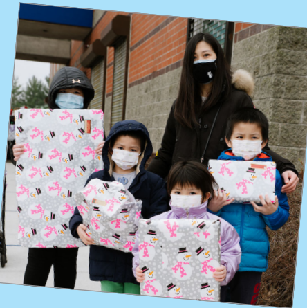
Your support brightened the holidays for so many people in the community.