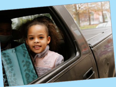
A young girl receives a holiday package at Goodwill’s Youth Holiday Party.